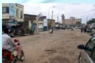
LADIPO MUSHIN State of the Road BEFORE LAMATA's Intervention