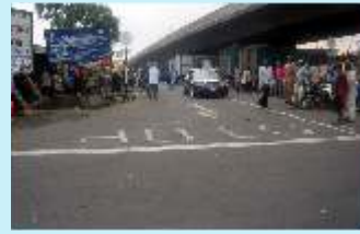
Daleko Junction After LAMATA's Intervention

It needs to be emphasized that through LAMATA's road development programme, the Lagos State government is doing more than improving roads. It is also creating jobs . These contracts have together generated direct employment for about 6,000 grassroots people in Lagos State.