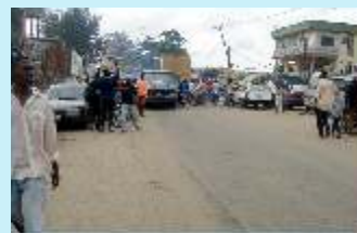
ALABA ROAD NOW

The periodic maintenance works involve application of asphalt overlays, reconstruction of walkways, road markings and installation of concrete lined drains to control flooding. They also entail some minor Traffic System Measures such as signage and traffic light installation at some junctions.