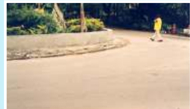
Oba Akinjobi Roundabout BEFORE LAMATA'S Intervention