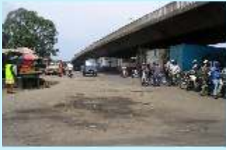
Daleko Junction Before LAMATA's Intervention