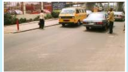
Ogunlana Drive, Surulere