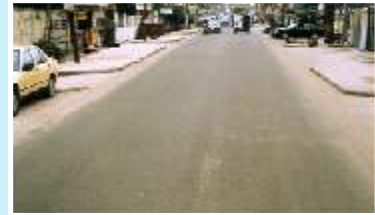
Randle Avenue, Surulere

These roads are now a delight for commuters to drive on because they have been provided with new asphalt overlays and concrete walkways, as well as concrete lined drains to prevent flooding. In addition, they have also been provided with adequate Traffic System Measures such as road markings, new signages and streetlights.