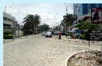
Idejo Street After Completion (July 2006)