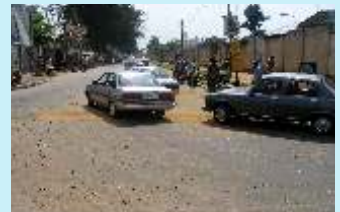
Anthony - Ilupeju Interchange - Before