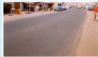
Jagunmolu Street, Bariga