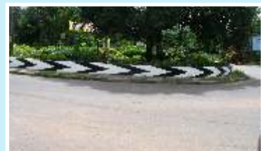
Oba Akinjobi Roundabout AFTER LAMATA'S Intervention