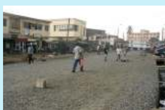
LADIPO MUSHIN State of the Road BEFORE LAMATA's Intervention