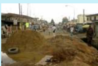
LADIPO MUSHIN Present state of the road DURING LAMATA's Intervention