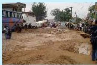
ALABA ROAD - BEFORE