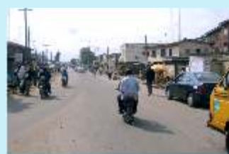
LADIPO MUSHIN State of the Road DURING LAMATA's Intervention