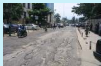
Idejo street Before LAMATA's intervention

The roads to be repaired are intended to reduce travel time, reduce cost of transportation and ultimately lead to poverty reduction of the generality of the Lagos residents. All these efforts and investments in road development are in preparation for the mass transit system LAMATA intends to develop for the Lagos metropolis. LAMATA is pioneering in sub-Saharan Africa a holistic strategy involving the overall improvement of not only the road mode, but also the rail and water modes of transportation in the Lagos metropolis. The plan is to put in place systems such as Bus Rapid Transit (BRT) and the Light Rail Transit (LRT), to move large numbers of commuters at the same time.