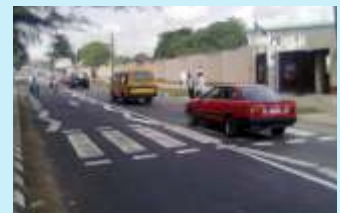
Anthony - Ilupeju Interchange - After